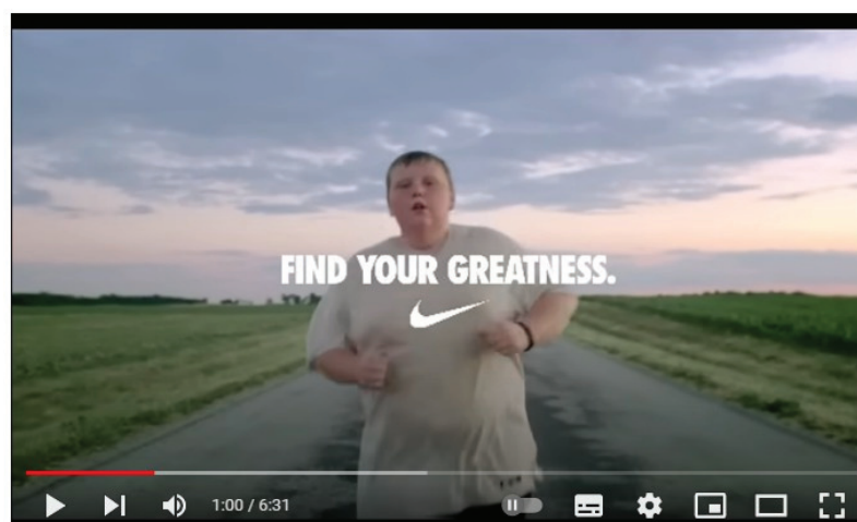
Figure 2. Nike: Find Your Greatness [Crimmins, 2012]

A phrase used in Nike narration: “ Greatness is just something we made up, somehow we’ve come to believe that reserved for a chosen few, for prodigies, for superstars and the rest of us can only stand by watching. You can forget that greatness is not some rare DNA strand, it’s not some precious thing. Greatness is not more unique to us than breathing. We’re all capable of it. All of us... ” reflects the visualization concept of Greatness . Anaphora gives the dynamism of perception. Narration is aimed at preparing potential consumers to perceive information in the image-sense mode by revealing the idea that greatness is attainable by everyone, and Nike’s products can help individuals achieve their own definition of greatness. The speech patterns denoting actions can be seen in the following example: “ If greatness doesn’t come knocking at your door, maybe you should go knock on its door ” [Crimmins, 2012].