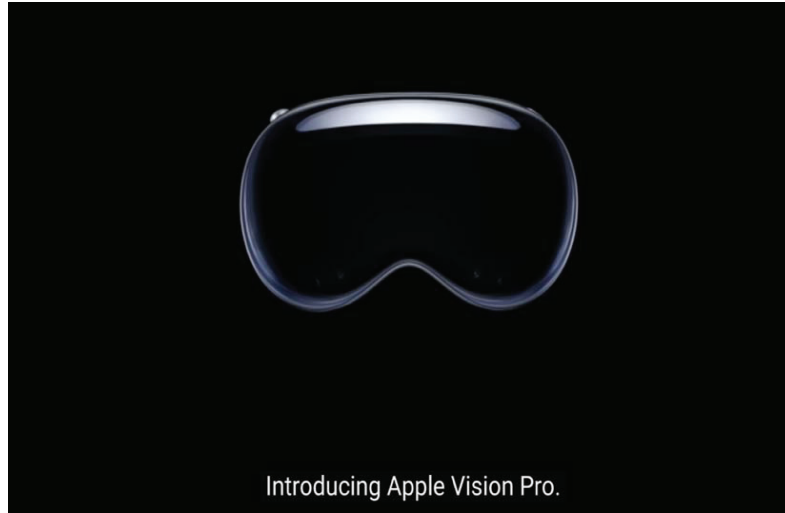
Figure 5. Apple Vision Pro FIRST LOOK [Spoonauer, 2023]

Graphical visualization in a commercial narrative represents the frequent use of pictures, photos, and emojis. A musical mode is also a powerful tool for emotional impact on consumers: some can evoke melancholy some can ignite enthusiasm adding a layer of meaning (sound-sense mode) [Spoonauer, 2023]: