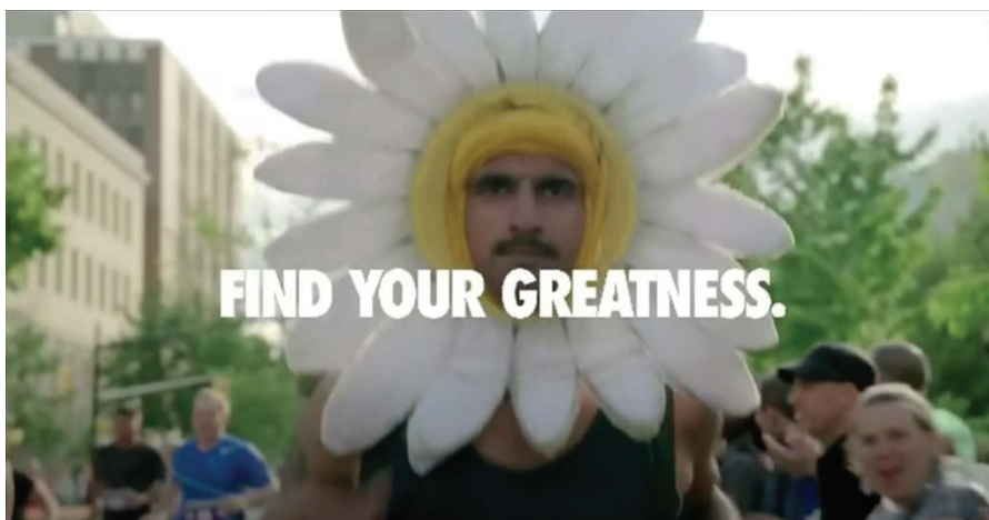
Figure 4. Nike: Find Your Greatness [Crimmins, 2012]

Smiling, bright eyes, slightly raised eyebrows, cheerful tone of voice, slow and deliberate eye contact, erect confident posture, emphatic hand gestures, pointing, descriptive hand gestures, professional dress, and appearance. Synchronization with the viewer occurs, he identifies himself with the main character – exposure – at first the hero rushes to the car, sings a song – this is me (oxytocin is released), then mastery of the emotional brain occurs: connection, climax, conflict – dilemma (tension) – resolution the language we are waiting for is a reward (dopamine is produced), epilogue. Show different before and after pictures – the difference excites motivation, inspires energy.